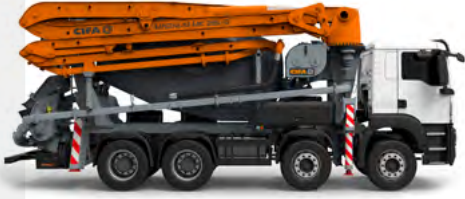
Placing boom MK28L-5"